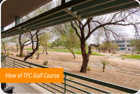
View of TPC Golf Course